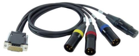
Breakout cable for Mini-DA42: input: 1 * AES42, output: 1 * AES3 out, 2 * analog