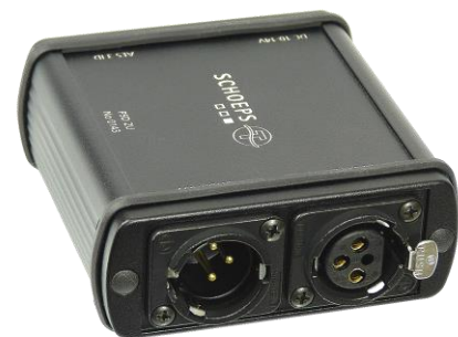
PSD 2U: Powering box for digital microphones with AES3 outputs (XLR/RCA)