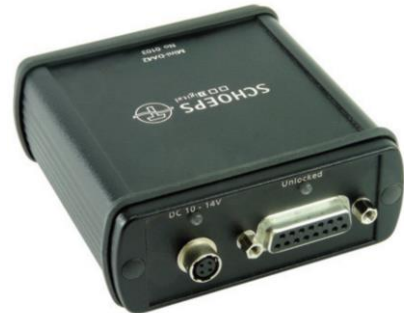
Mini-DA42: AES42 converter with analog outputs