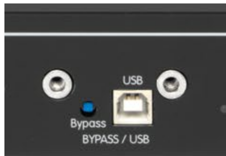
SPL USB port

Thanks to the built in Led clock/timer you are free to program a completely different sound level at different periods of the day.